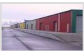
Investment property in SODO, Seattle.